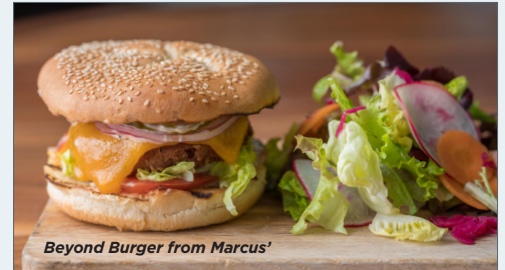
Beyond Burger from Marcus'

Every meal you eat with us is designed to delight your senses, feed your spirit, and nourish your body. Our inspired food and imaginative bar offerings spring from an unrelenting passion for excellence: locally sourced, seasonal ingredients, magnificent freshly-caught seafood, consummate skill and sparkling creativity. From laid-back casual dining to world-class cuisine, we have curated a special collection of culinary experiences right here in the resort. Please visit www.thehamiltonprincess.com for more information about our restaurants.