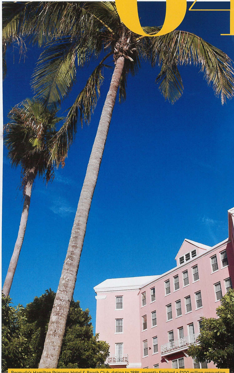
Bermuda's Hamilton Princess Hotel & Beach Club, dating to 1885, recently finished a $100 million renovation.

Suddenly, signs of revival are everywhere. Most obvious are the literal ones—hanging in the capital, Hamilton, and from the 1846 Gibbs Hill Lighthouse—advertising the 35th America's Cup, coming this spring. “America's