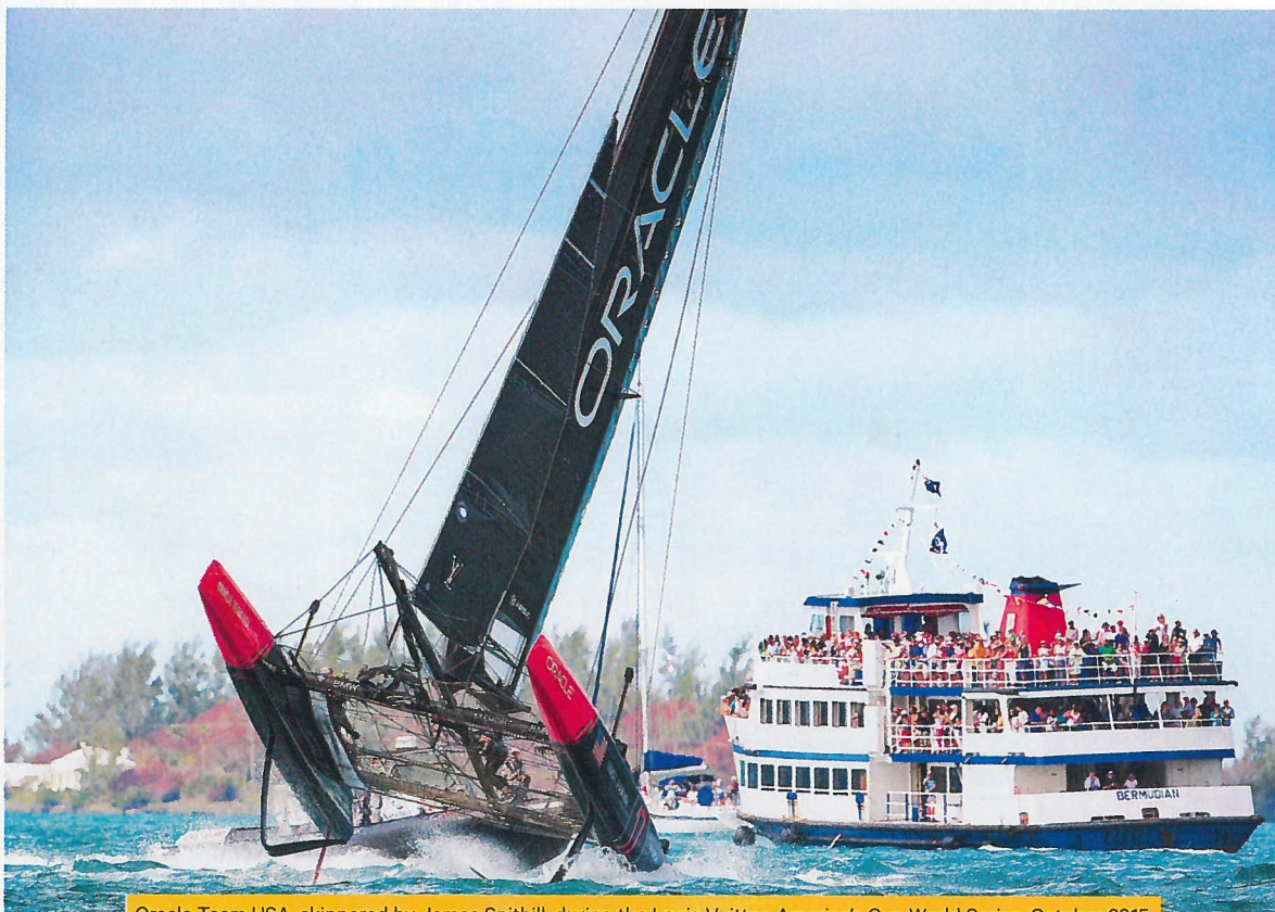
Oracle Team USA, skippered by James Spithill, during the Louis Vuitton America's Cup World Series, October 2015

298-6990) at Tucker's Point, the Italian-tinged Mickey's Beach Bistro (441-236-3535) at Elbow Beach, and the ultratraditional Coral Beach (441-236-2233), where male customers and staff still wear blazers, Bermuda shorts, and kneesocks, summoning ghosts of the island's heyday.